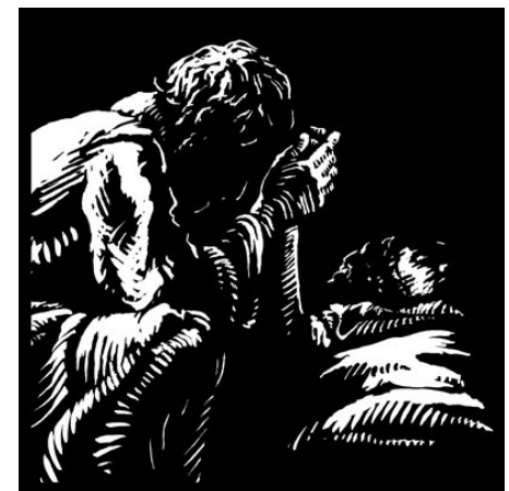
NOW SIMON'S MOTHER-IN-LAW WAS IN BED WITH A FEVER; AND THEY TOLD JESUS ABOUT HER AT ONCE.. HE CAME AND TOOK HER BY THE HAND AND LIFTED HER UP. Mark 1. 30-31

Today we see that his works of healing, firstly of Peter's mother-in-law and then of crowds of people "suffering from diseases of one kind or another," take their toll. He needs to get away; he needs to pray. We